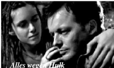
Alles wegen Hulk

„...A Swiss TV-production that convinces in evry aspect. The film is perfectly directed, excellently played and has got a touching story..."