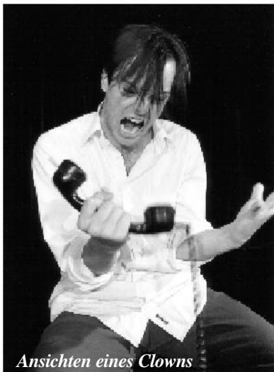
Ansichten eines Clowns