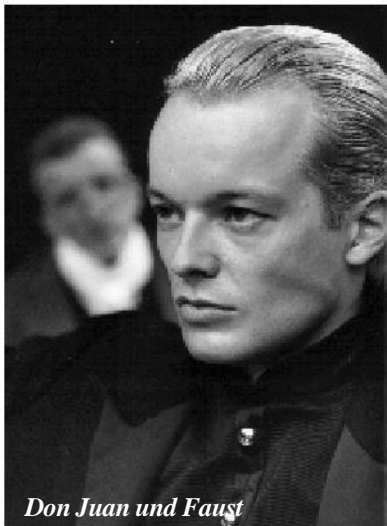
Don Juan und Faust