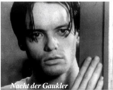
Nacht der Gaukler

Variety, 7.10.96 : The Silence Within (Nacht der Gaukler)